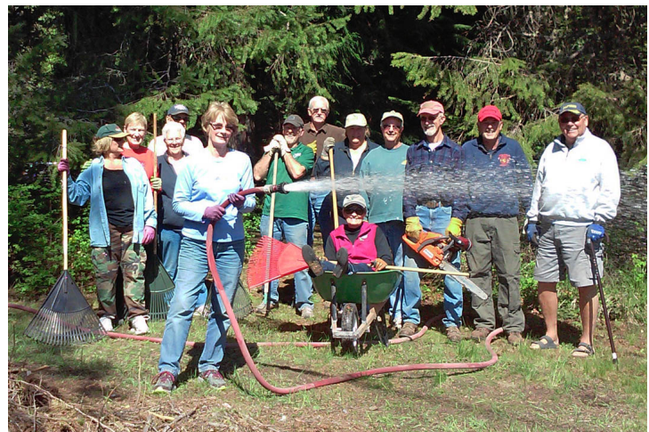
Cleanup Day at Myers-Harter Park 2015

Also exciting is the proposed trail system addition connecting with our Fertile Valley Road and continuing onto 211 with a wider road that will include a walking/biking trail. Working with the other directors is important to me: concerned people gathering to help make our lake the best it can be for our future generations.