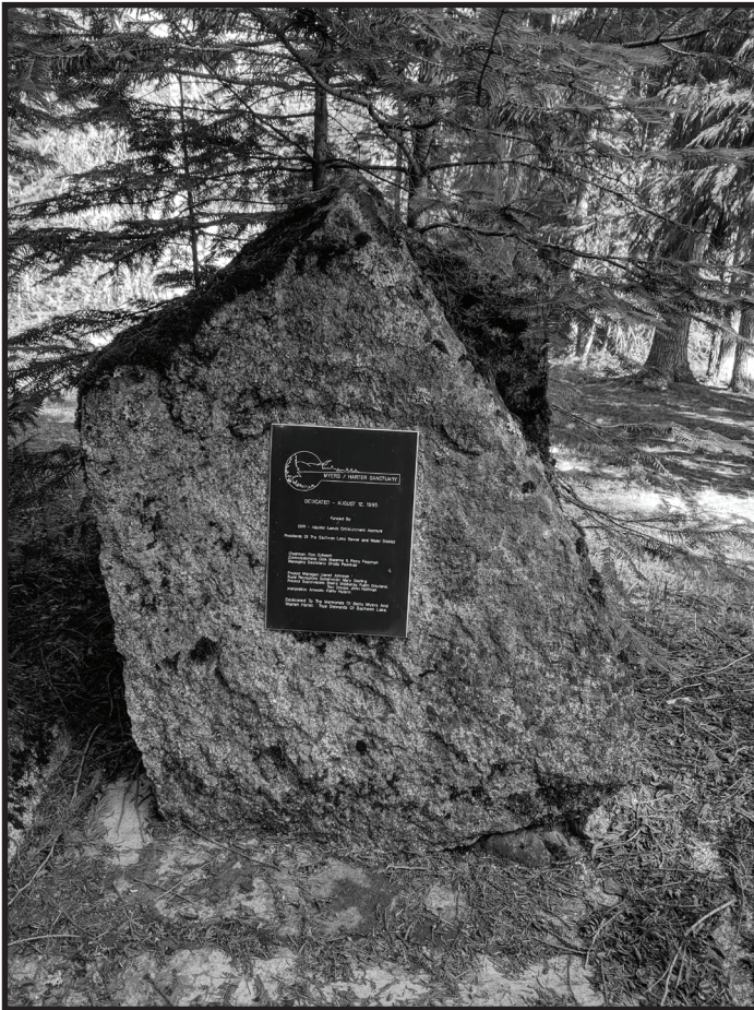
Myers/Harter Sanctuary. This park was developed with funds from the Aquatic Lands Enhancement Account to allow the public access to state waters.