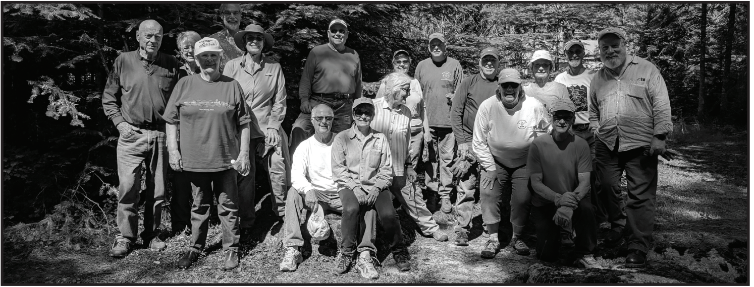
The clean up crew pauses briefly for a photo op.