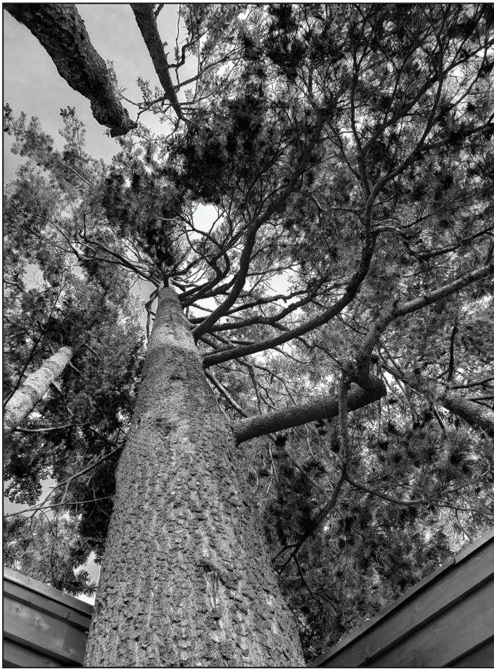
Tree Top Beauties