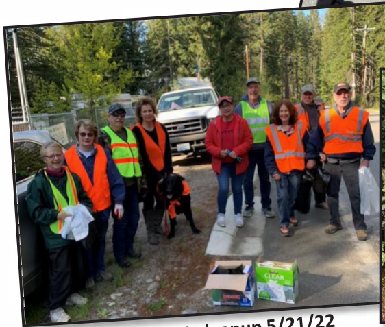
Hwy 211 cleanup 5/21/22