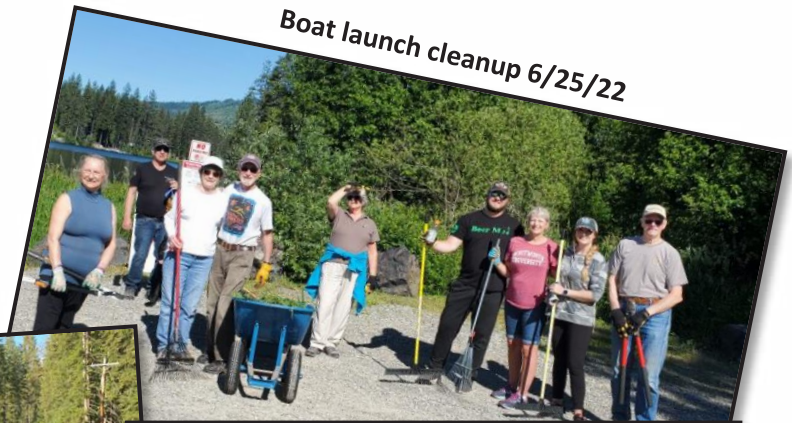
Boat launch cleanup 6/25/22

We've had a few volunteer opportunities over the past few months. I can say from experience it is so rewarding to give back to our community, and such a fun way to stay connected with friends around the lake! Below are a few highlights.