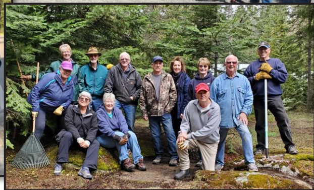
Myers-Harter Park cleanup 5/7/22