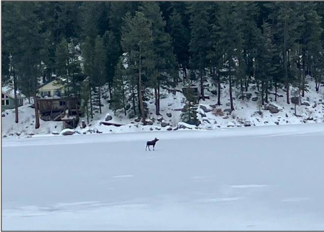
A moose tests the ice thickness

As the winter winds down, we don't want you to forget (even possible?) the joy our winter wonderland brings to us, so we've included a few Sacheen Lake winter photos to help you remember (or to get you to long for spring and summer even more!). On a related note, the SLA received more guesses for the ice-off contest than we have for a number of years. We appreciate the community's involvement! Good luck to all entrants (except those whose date has come and gone - sorry)!