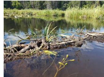
Start-up Beaver Dam on West Branch of Little Spokane River