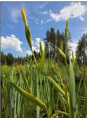
Promise of Spring