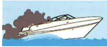
"Station wagon effect" or back drafting.