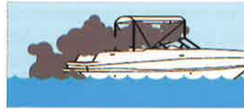
Exhaust gas trapped in enclosed places.