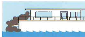
At slow speeds, while idling, or stopped, CO can remain at dangerous levels in and around your boat, even if the engine is no longer running.