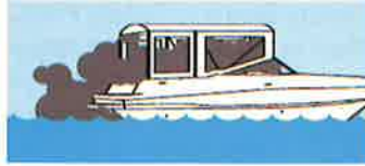
Inadequately ventilated canvas enclosures.

CO can accumulate in all of the following manners: