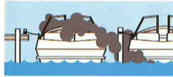
Another vessel's exhaust. CO from the boat positioned next to you can be just as deadly.