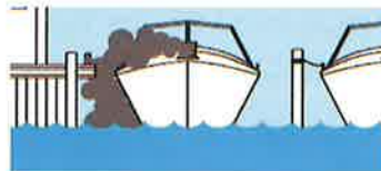
Blocked exhaust outlets.